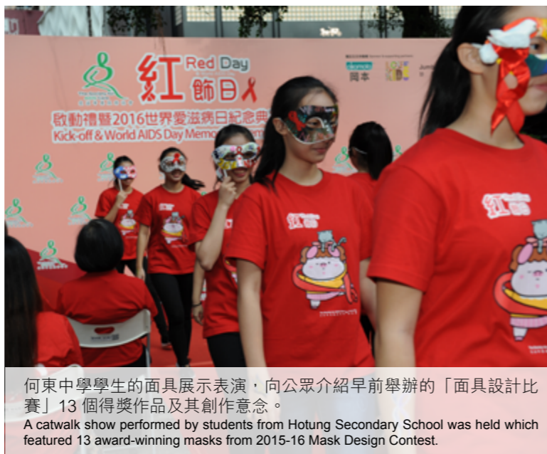
何東中學學生的面具展示表演，向公眾介紹早前舉辦的「面具設計比賽」13 個得獎作品及其創作意念。 A catwalk show performed by students from Hotung Secondary School was held which featured 13 award-winning masks from 2015-16 Mask Design Contest.

「紅飾日」邀請了《診所低能奇觀》作者珍寶豬設計數款禮物，包括 T 恤、小型毛公仔及布袋，每樣都有關注愛滋病的紅絲帶標誌，希望鼓勵大眾正確認識愛滋病，消除社會對感染者的標籤和歧視，讓有需要人士可以安心接受治療，最終杜絕愛滋病病毒蔓延以至因病死亡，共同創造零感染的未來。